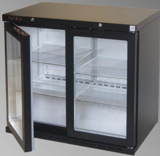
905mm Standard Height Range